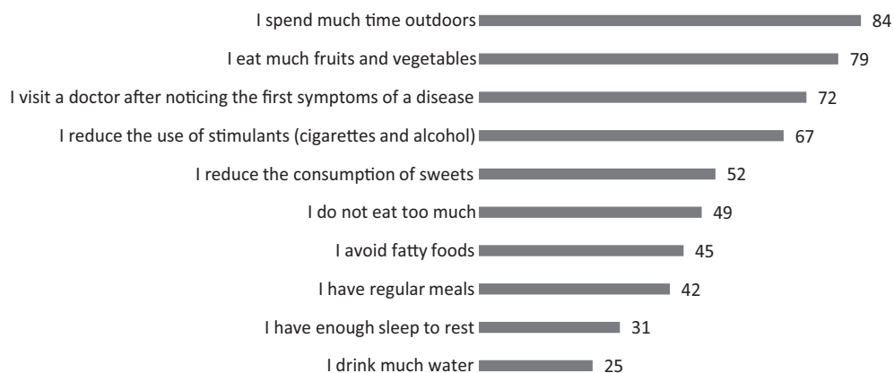
Figure 2. Ways of taking care of one’s health as indicated by the interviewees* [N = 100, %]

An important part of the study was to ask the women if and how they take care of their health (Fig. 2). Seventy-four respondents confirmed they do take care of their health condition, twenty of them regretted they do not, while six found it difficult to provide an exact answer. Women aged over 60 declared more frequently (35%) to take strong care of their health. In turn, the analysis of the way women take care of their health shows that the female population covered by this study declare to perform the following outdoor activities: “walking”, “running”, “gardening” and “Nordic walking”. These are the most common health-promoting activities cited by the interviewees. Being physically active is highly beneficial. First, it allows to get into good physical condition while contributing to a sense of mental and physical wellbeing. Moreover, physical activity certainly is a great way to stay fit and good-looking. The second important aspect in taking care of one’s health is to consume large quantities of fruits and vegetables. This is crucial as it may contribute to reducing the risk of certain diseases of affluence. Also, as corroborated by research, a regular and abundant consumption of fruits and vegetables reduces the risk of cardiovascular diseases. In turn, the Agricultural Report (2022) emphasizes that “40% of Poles eat extremely small amounts of fruits and vegetables (and only a few kinds of them). Women consume fruits and vegetables far more frequently than men”.